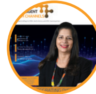
Intelligent Tech Channels