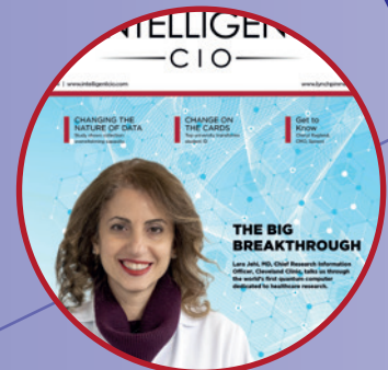
CIO North America