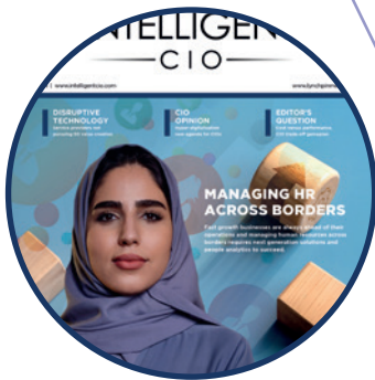
CIO Middle East