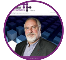
Intelligent Tech Channels LATAM